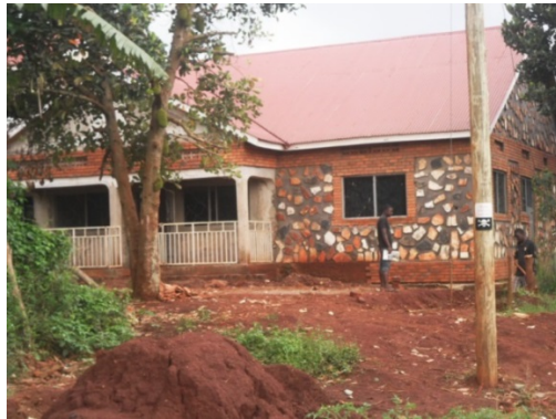
THE WANYANGE COMMUNITY CENTER